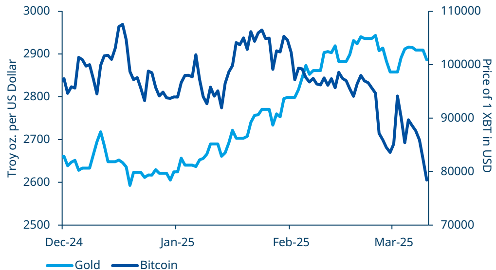
Figure 3 | Gold vs Bitcoin